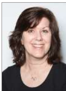
Head of Year