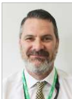
Deputy Head of Year